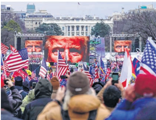
Violence at the US Capitol on January 6th 2021