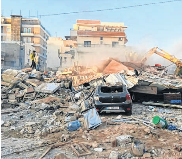
The aftermath of an Israeli strike on Lebanon